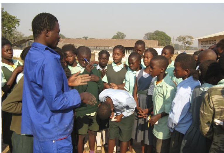
Class trip to Cedric's Farm

to remind us that turning a profit is not as easy as it sounds, and this has been true in these early days of chickens, vegetables and bananas. Our agri-business projects will need to expand considerably over the next few years before we see profits really contributing significantly to our running costs.