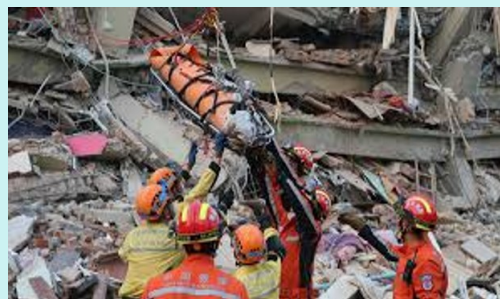
Rescue workers after the earthquake in Mandalay on March 28th 2025

The workshop costs include transport for participants and expenses for trainers, and food and accommodation costs. Thank you to everyone who has contributed to our support for the PCM during these years of trial and hardship.