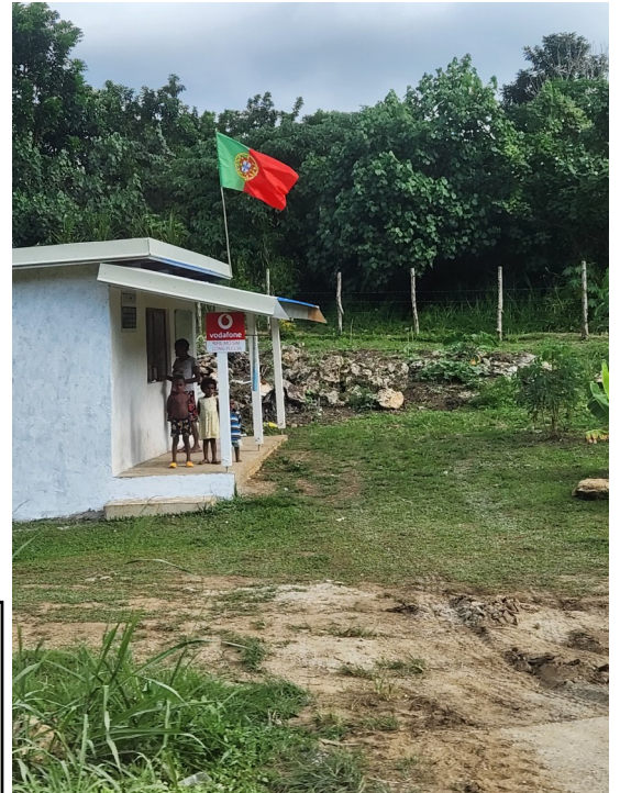
Vanuatu snapshots: Above, a common sight. Right, Vanuatu is Football World Cup crazy right now with flags being flown everywhere. This household is proudly supporting Portugal. Below, typical road travel around Efate, and two young boys trying a spot of fishing at sunset in Port Vila harbour