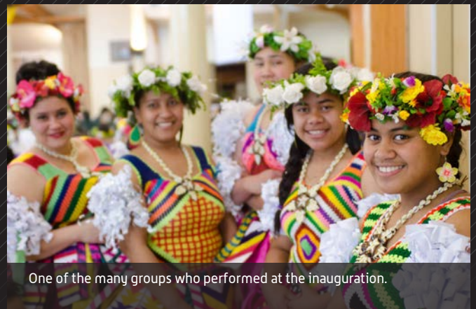
One of the many groups who performed at the inauguration.

Are you longing to make a difference? COME STUDY AT LAIDLAW!