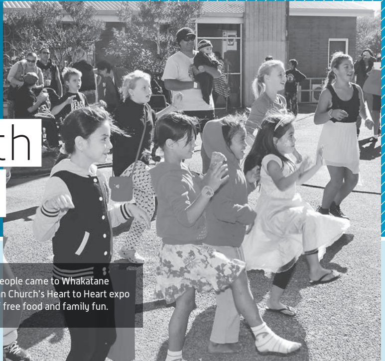
Over 500 people came to Whakatane Presbyterian Church's Heart to Heart expo for a day of free food and family fun.

Whakatane Presbyterian Church opened its doors and its heart to its community again by hosting a second Heart to Heart expo and family festival in May.