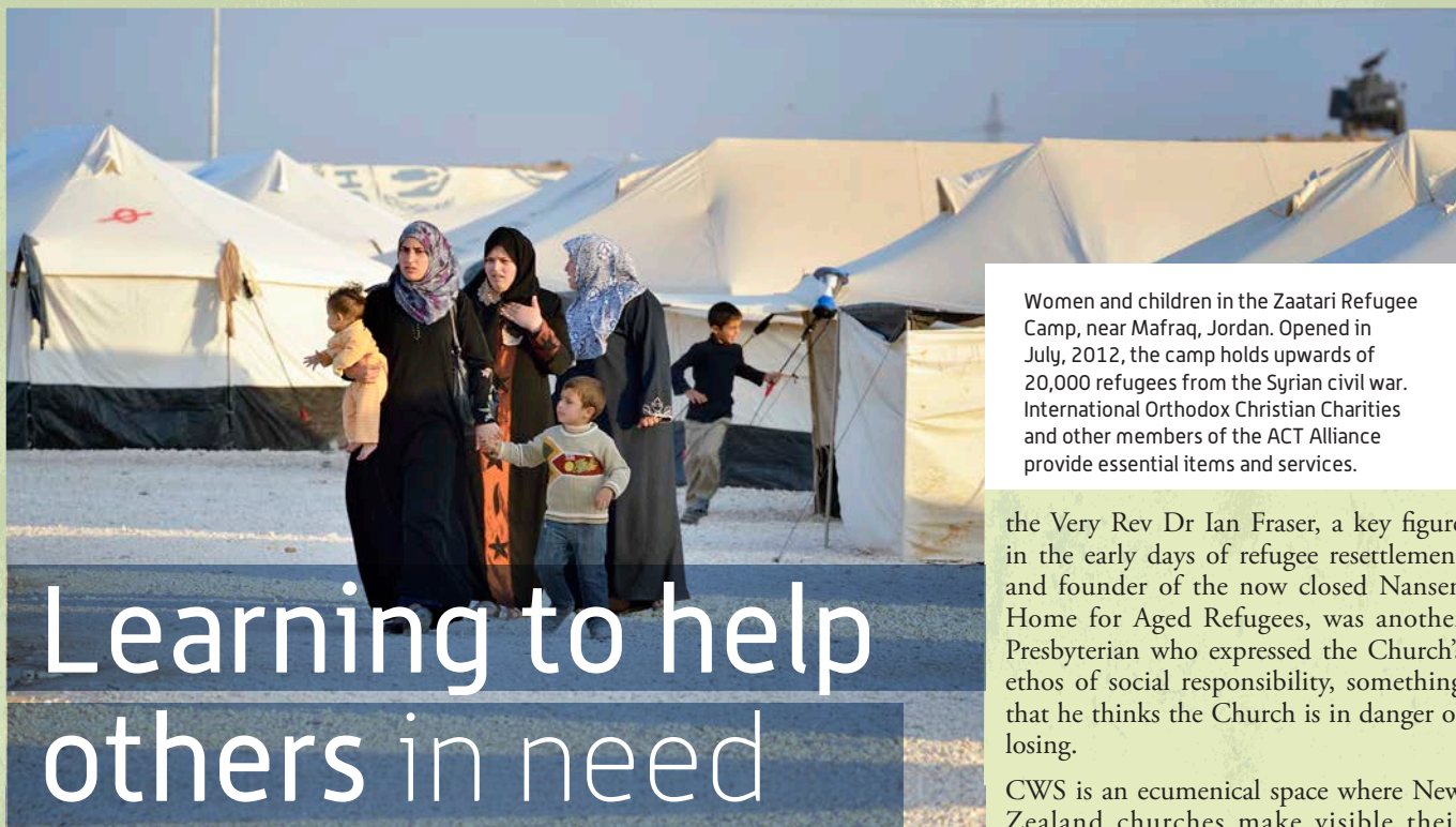
Women and children in the Zaatari Refugee Camp, near Mafraq, Jordan. Opened in July, 2012, the camp holds upwards of 20,000 refugees from the Syrian civil war. International Orthodox Christian Charities and other members of the ACT Alliance provide essential items and services.