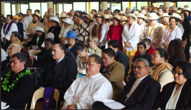
Large numbers turned out to participate in the Pacific Islands Synod presbytery inauguration ceremony and celebrations.