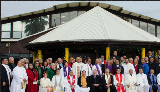
Dignitaries and special guests gathered during the inauguration for an official portrait.

In October last year, at General Assembly 2012, there was overwhelming support to grant presbytery status to the Pacific Islands Synod, giving it status and powers equivalent to a presbytery, or Te Aka Puaho, and the ability to govern and self-manage its contribution to the life of the Church