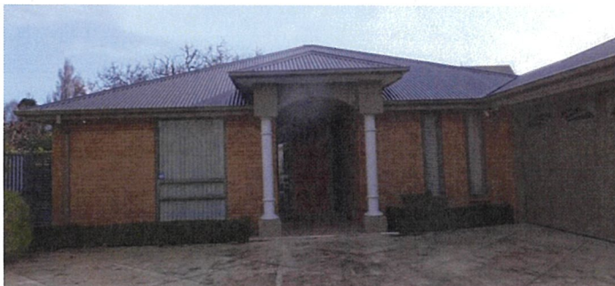
Situated down a quiet driveway

The church owns a manse at 9A Buxton Terrace, Christchurch, a modern three bedroom home built in 2002, which has had earthquake repairs and redecoration completed by EQC. It has a double garage and off-street parking, carpet in most rooms and a heat pump in the living area. It is on a back section with an easy-care garden.