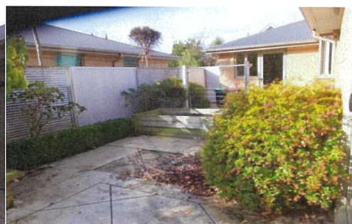
Easy care garden