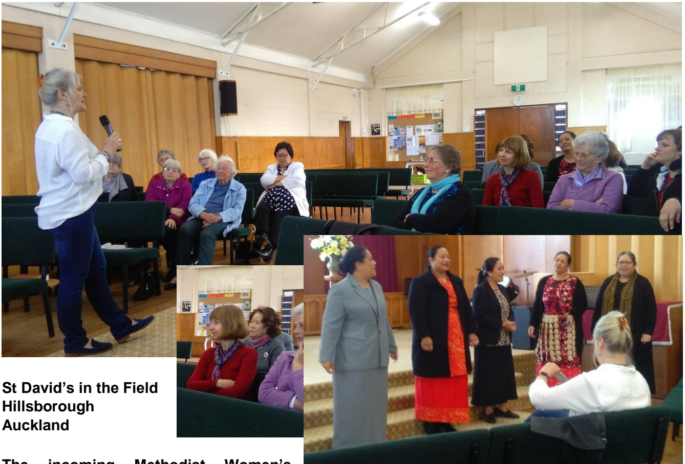
St David's in the Field Hillsborough Auckland

The incoming Methodist Women's Fellowship executive joined us.