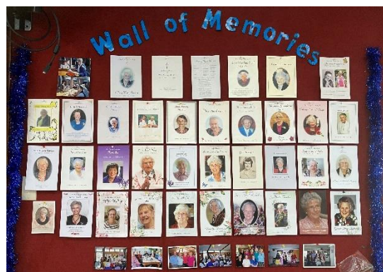
Wall of Memories paid tribute to late members