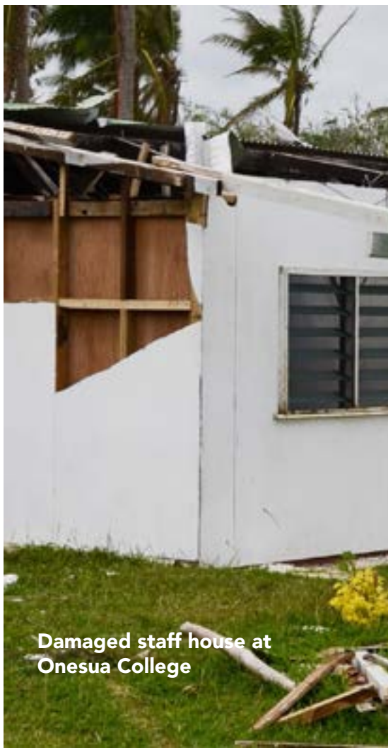
Damaged staff house at Onesua College