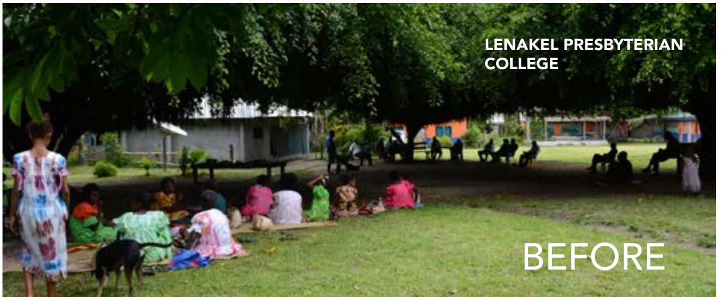
LENAKEL PRESBYTERIAN COLLEGE