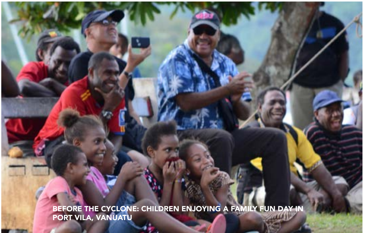
BEFORE THE CYCLONE: CHILDREN ENJOYING A FAMILY FUN DAY IN PORT VILA, VANUATU

The PCANZ's partnership with the PCV has never had its own specific name. So in January this year the Vanuatu Support Group decided to choose a name for this. The cyclone hit just as the name was about to be launched. The name chosen is Pacific Vision Vanuatu, which is why the Moderator's cyclone appeal is so named. Beyond cyclone recovery, Global Mission work in Vanuatu will continue to use Pacific Vision Vanuatu as the partnership name.