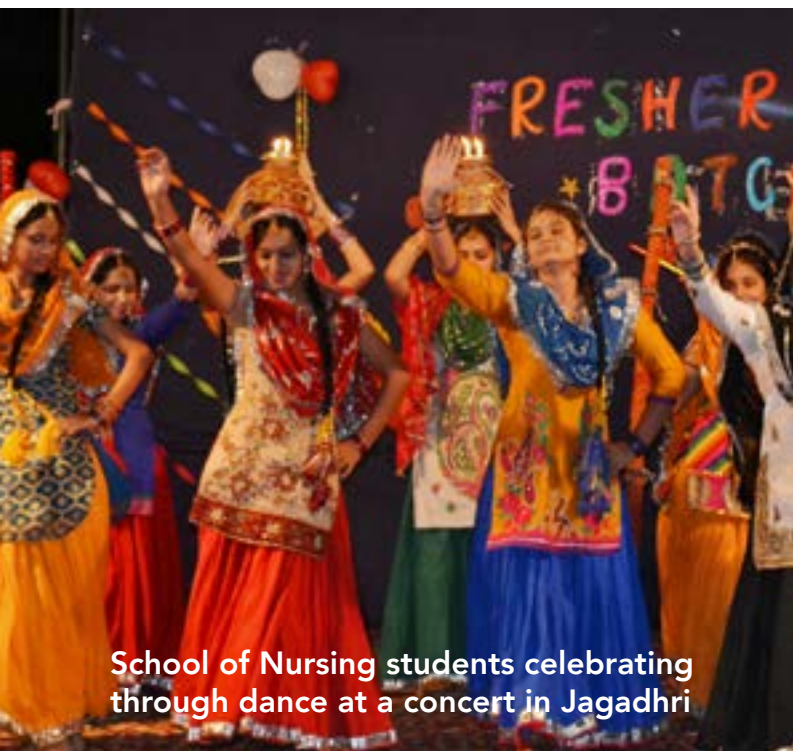
School of Nursing students celebrating through dance at a concert in Jagadhri