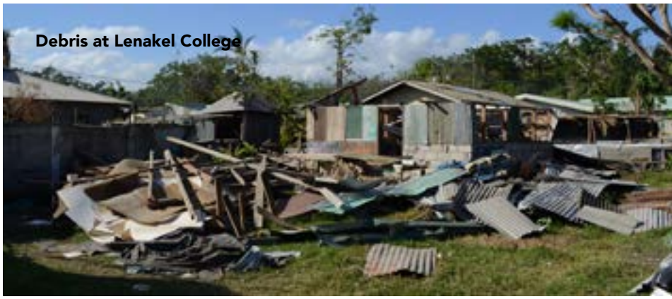
Debris at Lenakel College