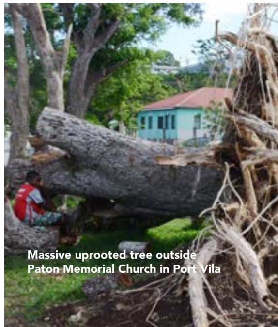
Massive uprooted tree outside Paton Memorial Church in Port Vila