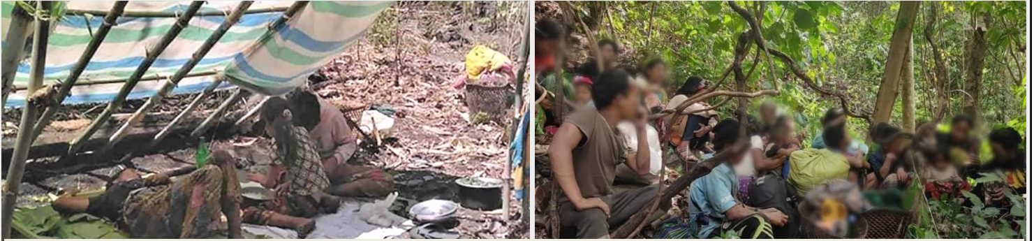
Residents of Mindat township have fled to the forests and camps for the internally displaced to try and find shelter from the violence that has erupted in their area. They had to flee carrying only the clothes they were wearing.