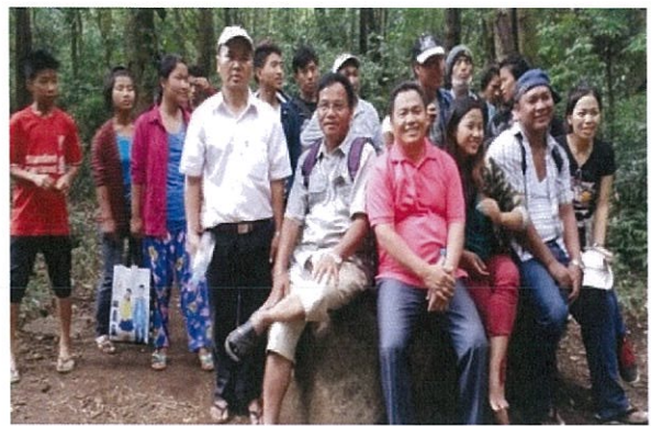
Participants at the youth leadership training event express their thanks to the PCANZ for our support.