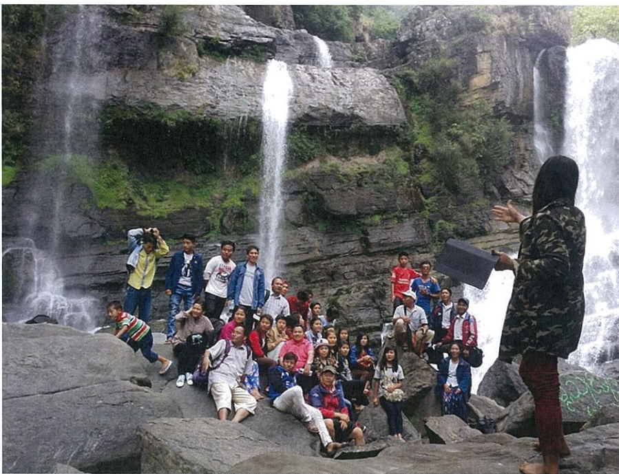
Despite its remoteness the Matupi region is well known for its natural beauty, with this waterfall being a popular attraction. The youth leaders gathered here for a photo shoot.