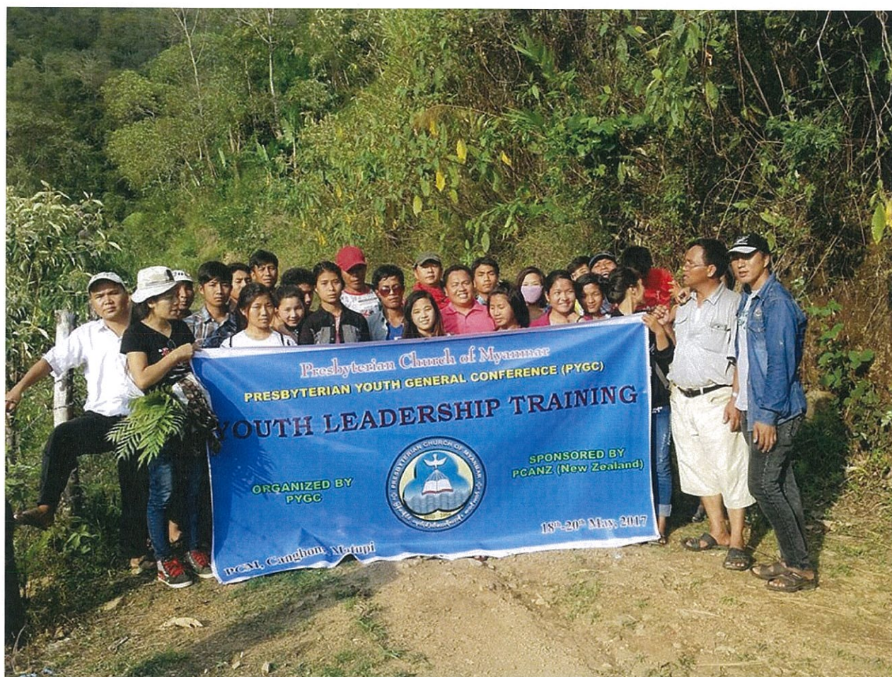
Young Adult leaders at a training event in the Chin State, sponsored by the Ricebowl Mission