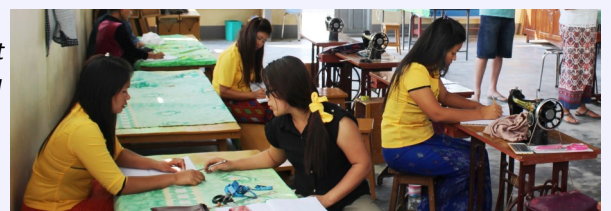
Right: Tailoring Training class