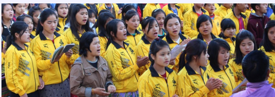
Left: Students worship at Victoria Boarding School

Scholarships for a Doctor of Ministry and a Master of Divinity programme, and four students at TTC—$6,600