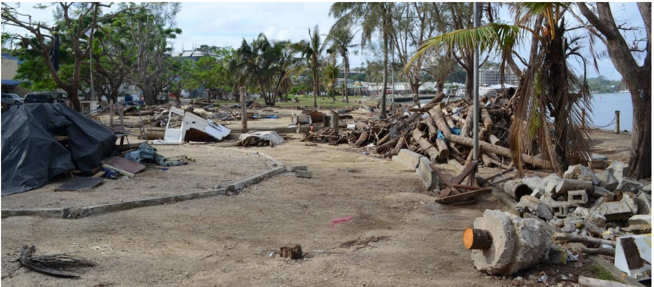
The Port Vila waterfront is unrecognisable.

In a report in the Vanuatu Daily Post on April 24, the United Nations Development Programme estimates that the loss of food crops is as high as 96 per cent. This, combined with severe damage to sandalwood and coffee plantations has destroyed the main source of income for a majority of the population and could have a negative impact on Vanuatu's economic development for years to come. The Vanuatu Government Department of Labour released statistics estimating that approximately US$7 million of personal income has been lost. The owner of Tanna Coffee said that it will be 18 months before he can see any potential for harvest, and that 500 growers have lost their entire incomes, with a further 5,000 indirectly affected. This economic impact will inevitably affect the PCV's ability to maintain the extensive ministry they have through their churches, colleges, schools and health programmes. Due to the size and role of the PCV in Vanuatu, their recovery is vital for the recovery of Vanuatu as a whole.