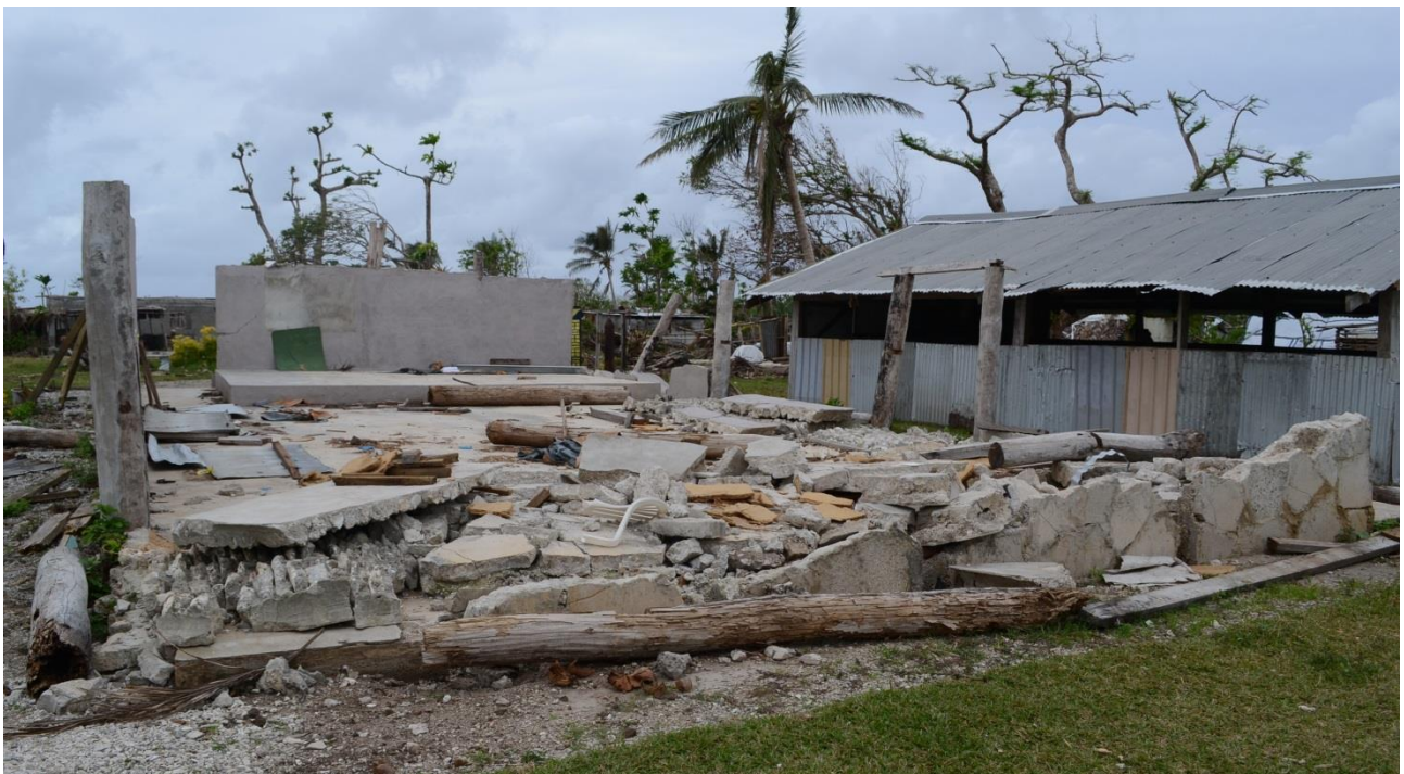
Takara Village church. Villagers had to flee for their lives when it collapsed.

Moderator's Appeal - The PCANZ is responding in a variety of ways. The first is by raising funds through the Moderator's Appeal, and we urge congregations, Presbyterian Church schools and individuals to continue to fundraise for this as the need is ongoing. Funds will be distributed to the PCV and applied according to the priority areas named above. One of the first ways in which we will be helping is donating funds towards the rebuilding of staff housing at Onesua College. As many as 13 of the college's 26 staff are in temporary housing because several staff houses were destroyed and others severely damaged. Rebuilding staff houses is a priority to enable the college to return to full capacity. Other rebuild projects will also be funded.