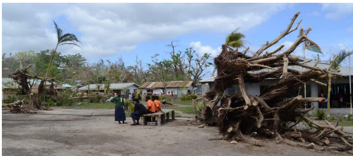
Massive trees were ripped from the ground at Lenakel Presbyterian College on Tanna Island.

The PCV is our primary international mission partner. It is the largest church in Vanuatu and has oversight of many schools and colleges. The PCV's Onesua College on Efate Island is a leading college with a proud history. Many of the nation's leaders have been educated there, including the current Prime Minister. The PCV also runs a highly respected community health programme and have a reach into all areas of Vanuatu life. The church has lost many buildings and many more have been severely damaged. As well as this, the income of many sectors of the population of Vanuatu has been affected due to the loss of livelihoods.