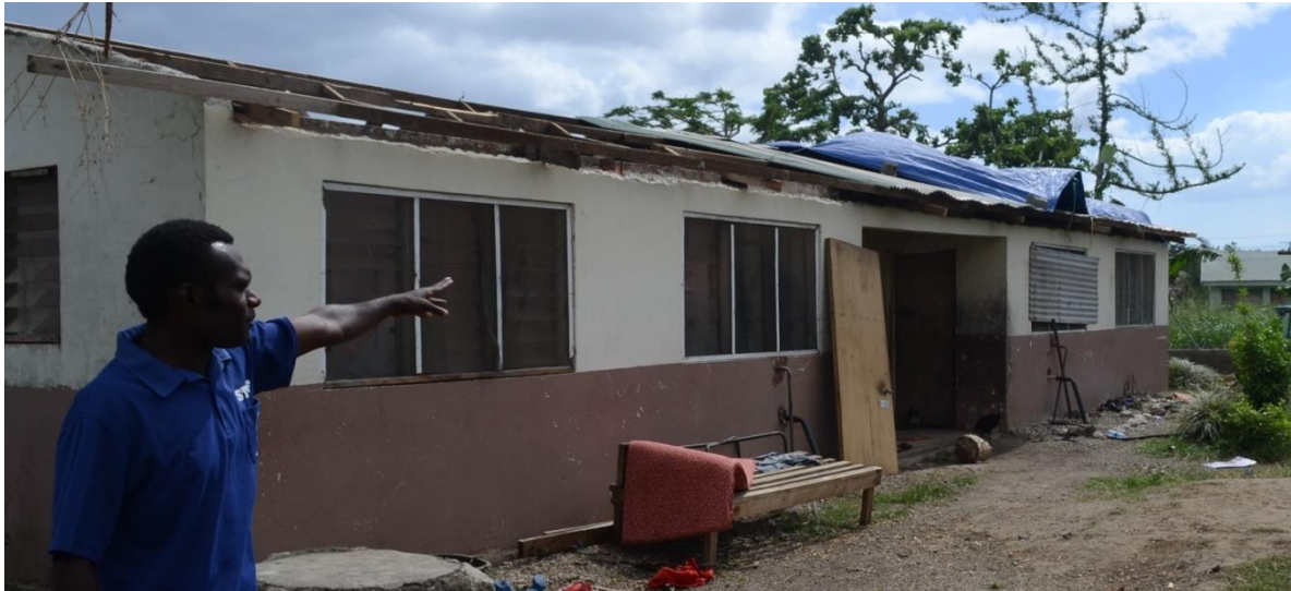
The Deputy Principal at Lenakel College in front of the house he and his family are still living in.