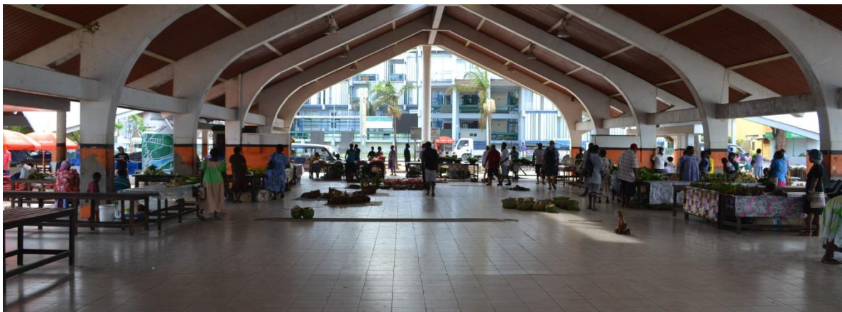
The normally bustling Port Vila Market is virtually deserted.

In a report in the Vanuatu Daily Post on April 24, the United Nations Development Programme estimates that the loss of food crops is as high as 96 per cent. This, combined with severe damage to sandalwood and coffee plantations has destroyed the main source of income for a majority of the population and could have a negative impact on Vanuatu's economic development for years to come. The Vanuatu Government Department of Labour released statistics estimating that approximately US$7 million of personal income has been lost. The owner of Tanna Coffee said that it will be 18 months before he can see any potential for harvest, and that 500 growers have lost their entire incomes, with a further 5,000 indirectly affected. This economic impact will inevitably affect the PCV's ability to maintain the extensive ministry they have through their churches, colleges, schools and health programmes. Due to the size and role of the PCV in Vanuatu, their recovery is vital for the recovery of Vanuatu as a whole.