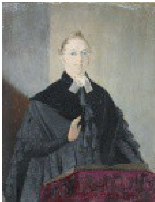
Rev John Dunmore Lang 1841

Lang ministered in New South Wales for 16 years and often found himself and his congregations at odds with the government and Church of Scotland-supported Presbytery of New South Wales. He travelled regularly to England on ecclesiastical business for the Presbyterian Church of the Australian Colonies 4 and on his fifth trip to Britain in 1839 he pleaded a case for a new Synod with the same rights and privileges of the Presbytery of New South Wales which had earlier been enacted in law as the official Court of the Presbyterian Church in Australia 5 . Lang also intended to persuade Church and government officials that Presbyterians in the colonies should be independent of the Church of Scotland.