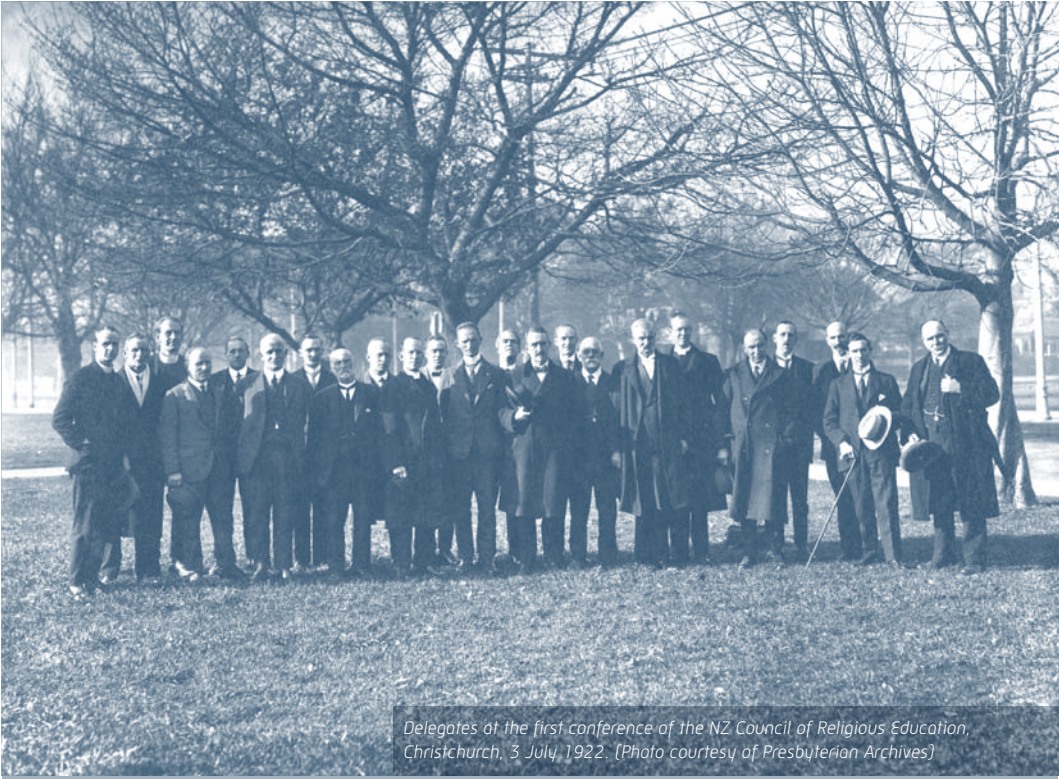
Delegates at the first conference of the NZ Council of Religious Education, Christchurch, 3 July 1922.