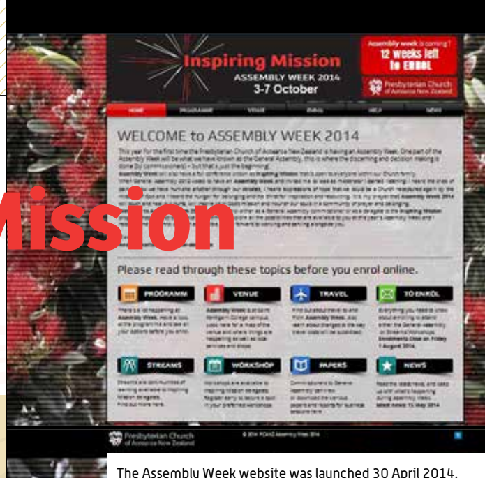
The Assembly Week website was launched 30 April 2014.

If you are arriving at Assembly Week by plane a free airport shuttle is available provided you enter all your travel details when you enrol. The Assembly Week website also lists a range of public transport options.