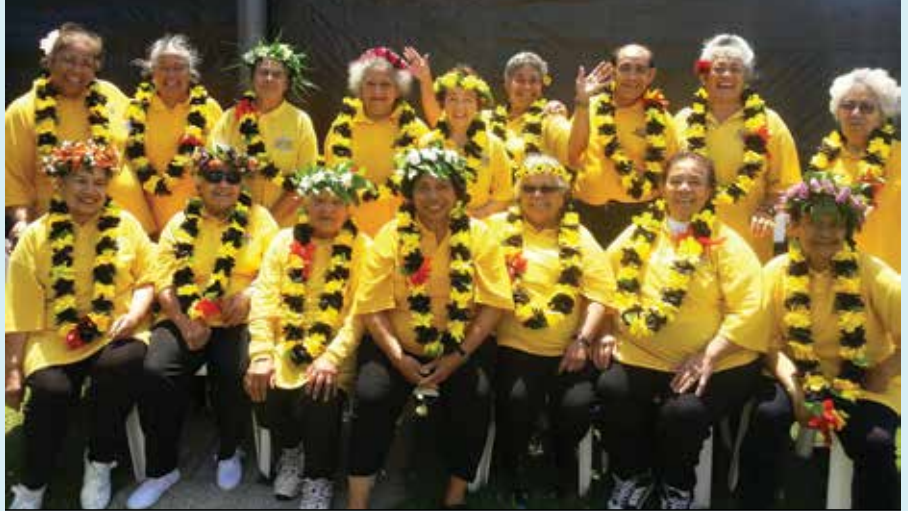
Some of the 40 strong Mafutaga Tagata Matutua multicultural exercise group at Wellington's Pacific Island Presbyterian Church in Newtown.

"She will do things like take members' blood pressure, monitor their weight and offer suggestions to attain, and maintain, a healthy lifestyle," Lafulafu comments.