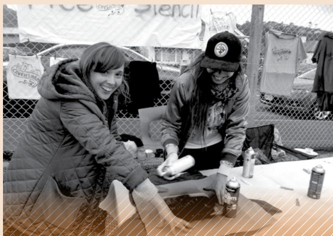
Young women from the Caversham Community Group designed a Caversham logo and printed it onto T-shirts.