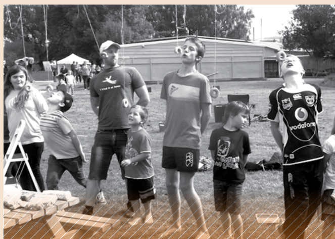
Eating donuts hands-free was among the many fun activities on offer at East Taieri Church's community fun day.

"The church and community people mixed really well. A lot of people said 'this is fun, we should do it more' and we do plan to do that."